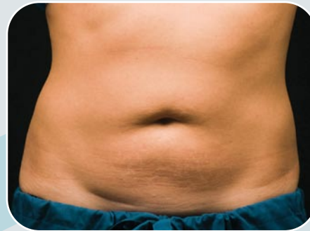
2 Months After Zeltiq Procedure