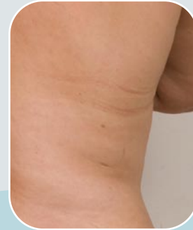
4 Months After Procedure