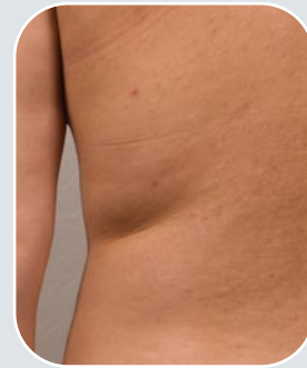
2 Months After Procedure