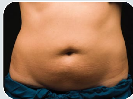
Before Zeltiq Procedure