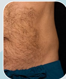
4 Months After Procedure